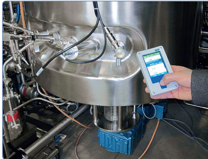
Figure 3: Arc sensor operation with Arc View Handheld at main fermenter