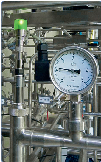
Figure 2: Arc sensor while transmitting data

Calibration on site is not necessary because of the integrated transmitter. All sensors can be calibrated conveniently in the laboratory with the Arc View Handheld before the process starts. The calibration data is then stored in the sensor for further use.